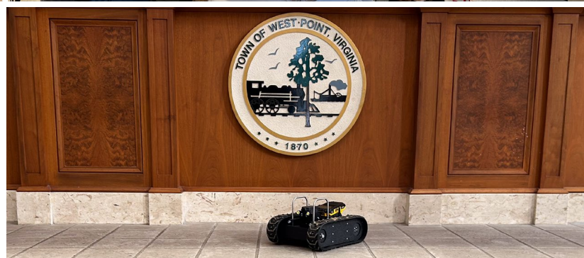
VRSA highlighted the unique uses members have found for the Risk Management Grant Program, including an inspection robot requested by the Town of West Point.

When a loss occurs, claims are handled professionally. Members are assigned a dedicated service team familiar with the entity,